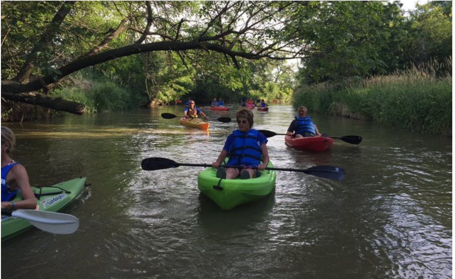
Kearney Paddle Sports / Facebook

Both journeys are wonderful for a day's adventure. The Platte River Kayaking Trip is a three-hour float that ends in the Bassway Wildlife Management Center.