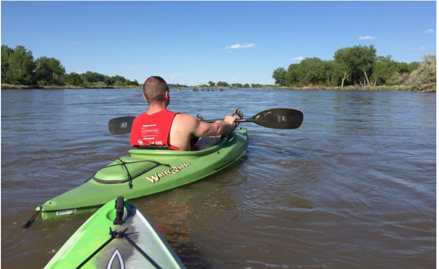
Kearney Paddle Sports / Facebook

Just show up 10 minutes earlier than your scheduled kayaking time, and bring good water shoes and any sunscreen, water, and adult beverages that you want to have on the trip.