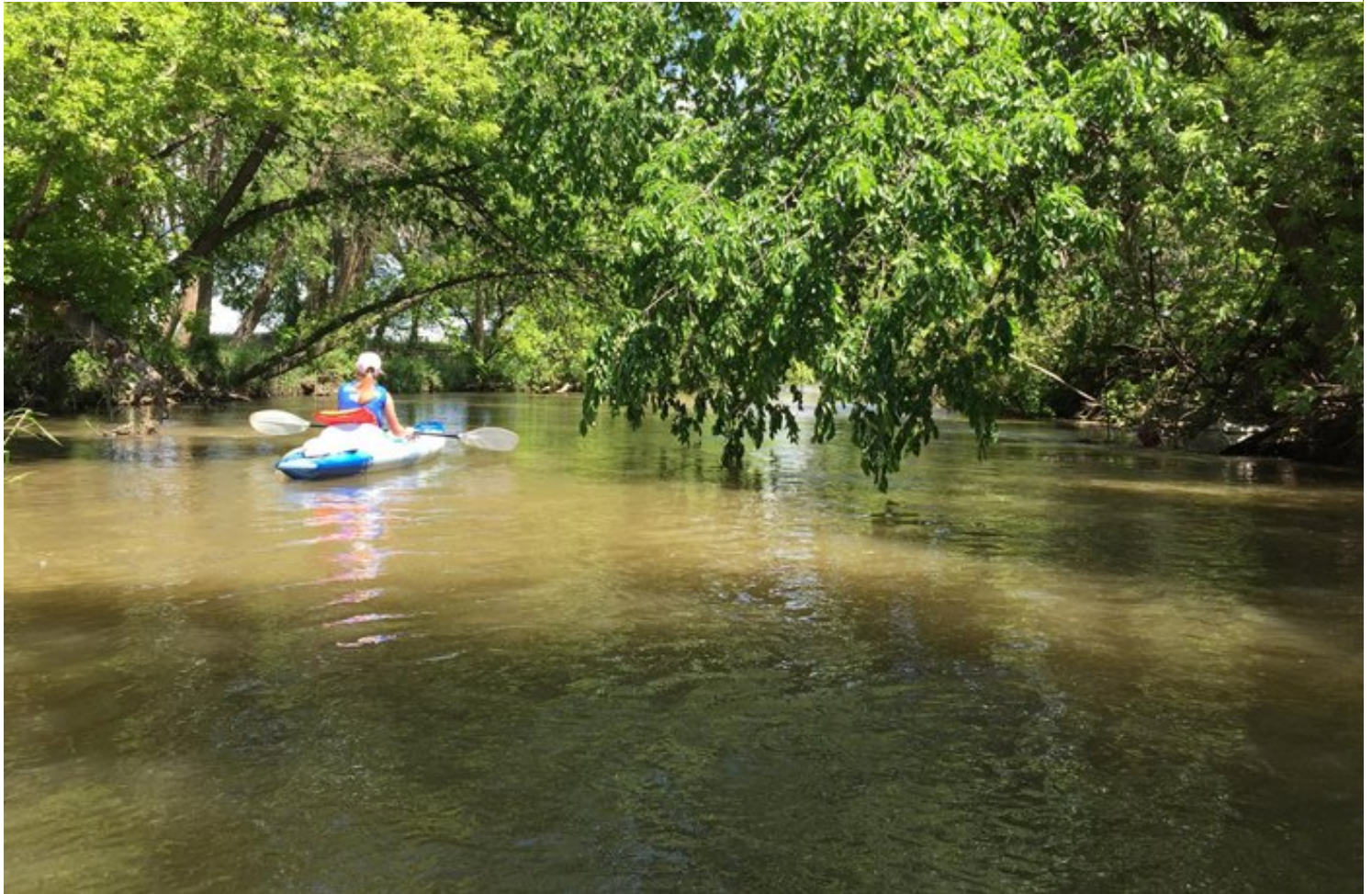
Kearney Paddle Sports / Facebook

This float actually takes you through a winding series of bends inside Kearney's city limits. It's a quick and easy adventure that doesn't take up the whole day!